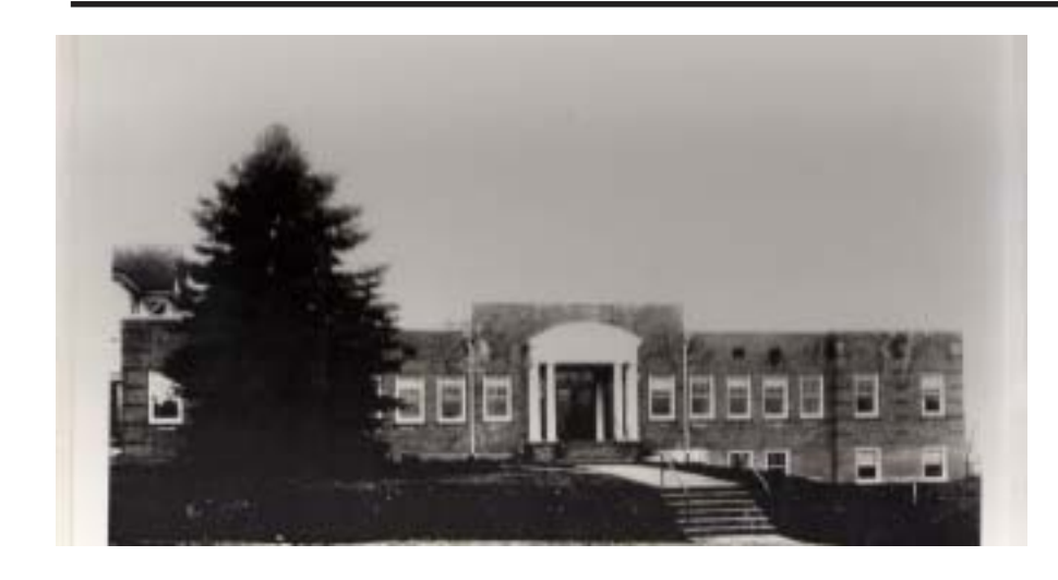
1937 Built next to Mount House