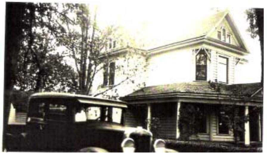
Mount House Silverton Hospital Association purchased the Mount property to build the "new hospital". The Mount house was left standing, and was used as the "nurses home".