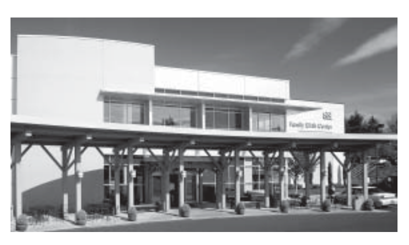
Family Birthing Center